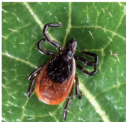
Blacklegged (deer) tick

During the last years, Lyme disease has become a health issue in eastern Canada. This disease is transmitted to humans by black-footed ticks ( Ixodes scapularis ) infected by bacteria of the genus Borrelia . It is the infection by those bacteria that causes Lyme disease in humans.