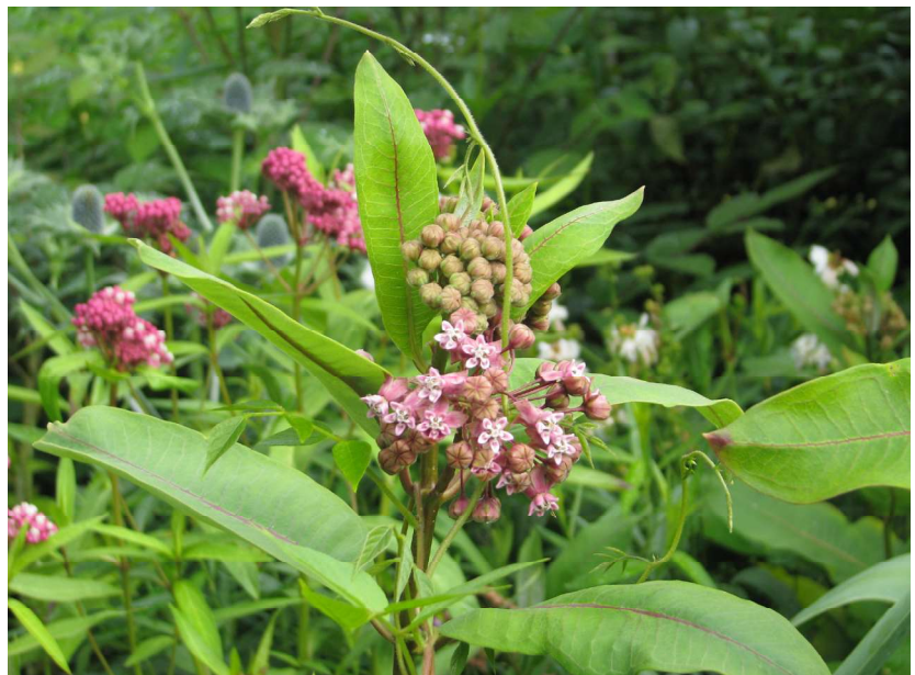
In the foreground, a common milkweed. In the background, swamp milkweeds.